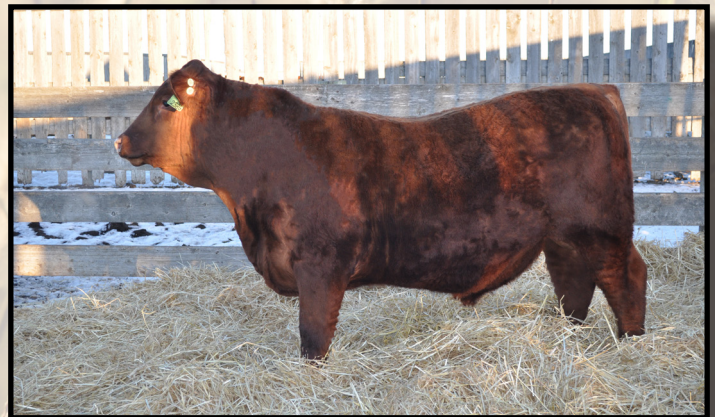
-Red BMB Kai 238G-

365 ADG: 3.10 lbs/day AOD: 9 yrs Cow Bull A powerful deep bodied, long spined, wide topped bull with loads of natural muscle shape.