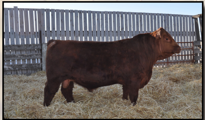
-Red BMB Creed 163G-

365 ADG: 3.47 lbs/day AOD: 9 yrs Cow Bull Another cow bull here with a dark cherry red hair coat. He has a strong topline, deep bodied with loads of natural muscle shape. Very eye appealing.