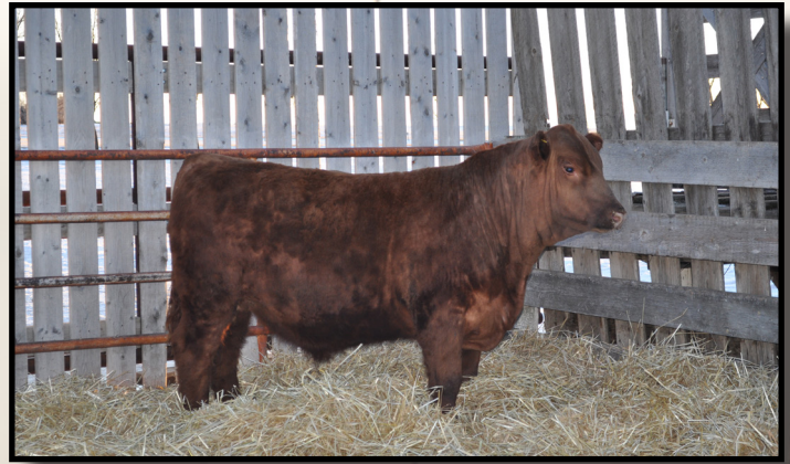
-Red BMB Fusion 91G-

365 ADG: 3.31 lbs/day AOD: 3 yrs Heifer Bull Here is a good performing heifer bull in a smooth made package.