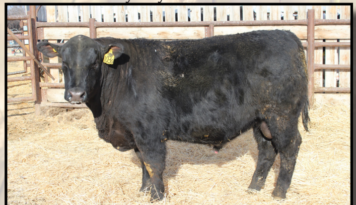
-Easy Ray Earnan 103G-