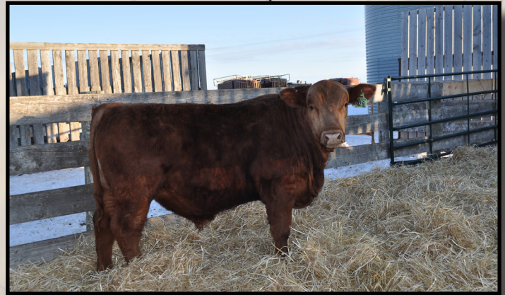
-Red BMB Spud 92G-

365 ADG: 2.99 lbs/day AOD: 7 yrs Cow Bull Definitely a cow bull here. Deep bodied with lots of muscle shape and stretch.