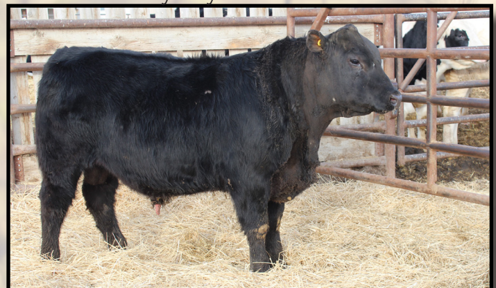
-Easy Ray Timeless 168G-

Cow Bull. He's in the top 10% and better for traits like WW, YW, and Total Maternal.