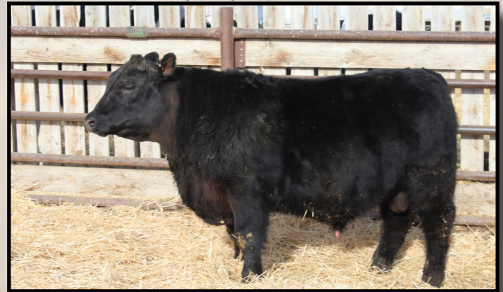
-Easy Ray Vision 110G-

365D Gain: 3.07lbs/day Heifer/Cow Bull. An all around great looking bull with Prime Vision genetics, explosive growth EPDs and he weighed just shy of 700lbs at weaning.