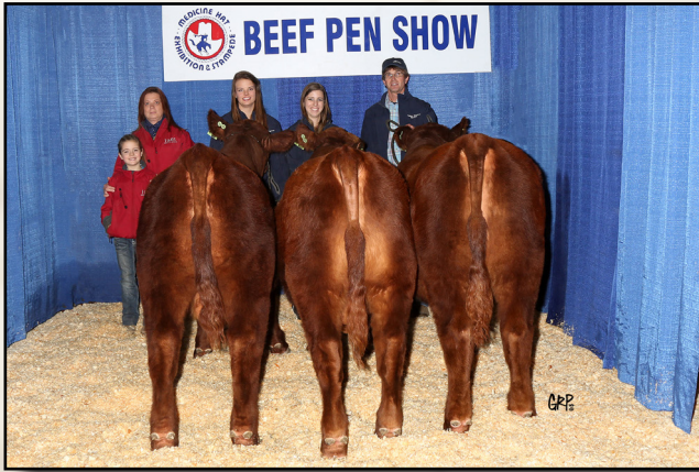
-Red BMB Goldman 811G-