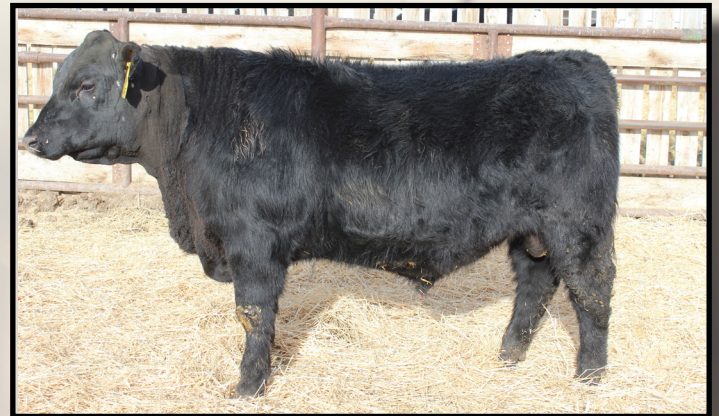
-Easy Ray First Cut 215F-

These 3 starting bulls are out of our Prime Cut sire whose dam sold for $140,000 at the U2 dispersal last November. An EPD profile like no other, calving ease, growth and carcass!