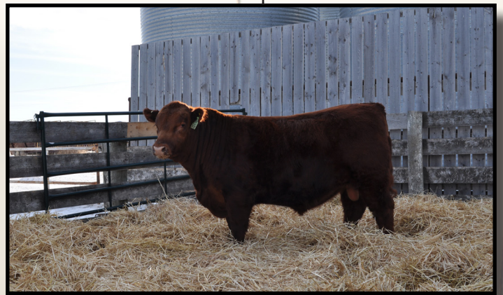
-Red BMB Temptation 513G-

365 ADG: 3.07 lbs/day AOD: 6 yrs Cow Bull Dark Cherry Red with a great haircoat. Deep sided, wide topped, wide hipped with loads of natural muscle shape. He is very quiet and has a great temperament.