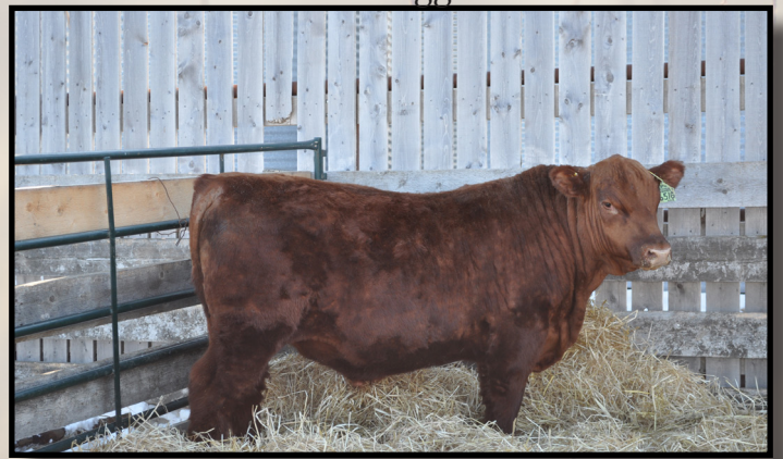
-Red BMB Trigger 651G-