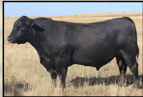
-sire of Vision 110G-