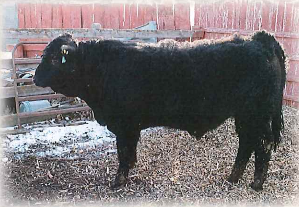
63G ~ Sired by: UPGRADE 73A ~BW: 85 ~ WW: 763