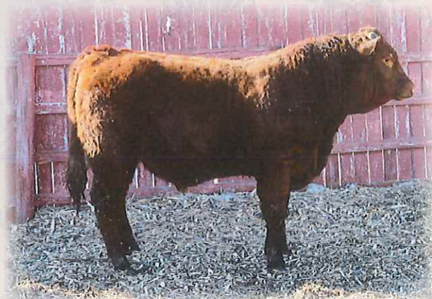
44G ~ Sired by: BOOMER 9B ~BW: 95 ~ WW: 693

Perlich Bros. Auction Market Ltd. @ Lethbridge, AB