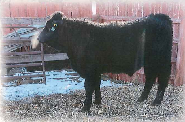
56G ~ Sired by: UPGRADE 73A ~BW: 85 ~ WW: 679