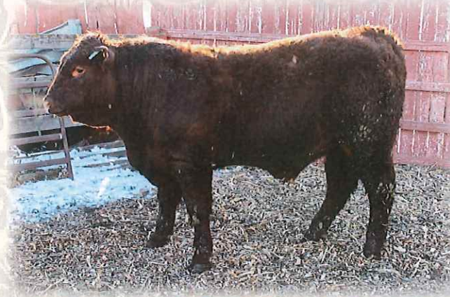
32G ~ Sired by: BOOMER 9B ~BW: 85 ~ WW: 760