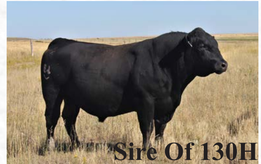
Sire Of 130H

A bull that excells in ribeye, marbling and carcass wt, you're gonna like him.