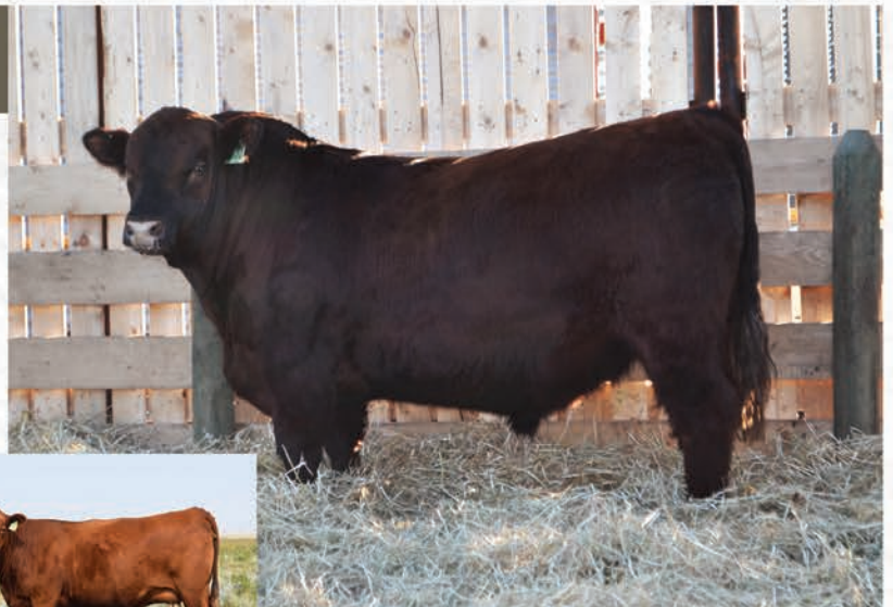
DAM: BMB 762C