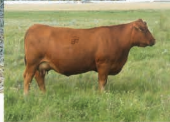
DAM: BLJ 50C

Weighing in at 1740 lbs on Jan 27/21. Deep red, smooth shouldered, easy fleshing bull with tons of middle. Here's another bull out of Red BLJ Misty 50C coming from Janessa's foundation cow family originating back to a female purchased from Thistle Ridge Ranch. Sired by one of our own herd sires Red BMB Moonshine 774C which goes back Red Crowfoot Moonshine 8081U and Red Brylor Toast 30T on the Granddam side. Maternal sibling to Lot #1B, BLJ 50H.