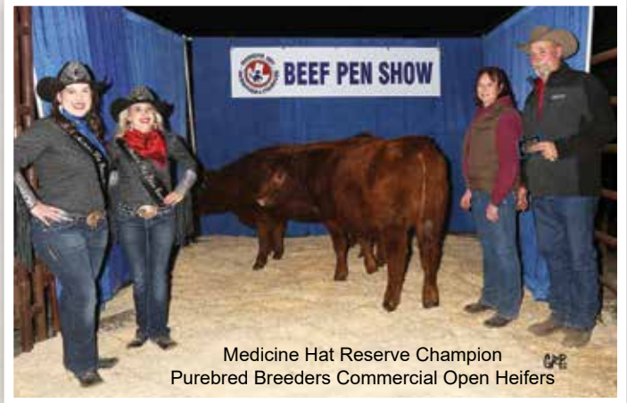
Medicine Hat Reserve Champion Purebred Breeders Commercial Open Heifers

Heifer Bull - A moderate-made Excel calf with a 78lb birthweight and an ideal makeup as a heifer bull. 202F is ranked in the top 9% of the EPD's for birthweight and on Sept 15/18 he weaned off at 865 pounds.