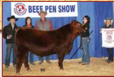
Red C.D. Big Time 6F Cattleman's Choice Calendar Year Bull Medicine Hat Pen Show

Here is a calf that puts together so many characteristics of a future herd bull. He comes with tons of mass, natural muscle shape and had been a standout in terms of his performance from a very young age. CRSL Prime Time has left his mark in our program, producing complete, deep-made, sale-feature bulls and stylish, big-middled females that have gone back into the cowherd. 6F's dam is a super attractive, easy-fleshing female that is starting to build a reputation for producing unique, stand out individuals. Here is a bull proven for performance with a weaning weight over 1,000 lbs. This calf was one of the highlights in our Medicine Hat Show string and we were honored to have him chosen as the 2018 Cattleman's Choice Calendar Year Bull.