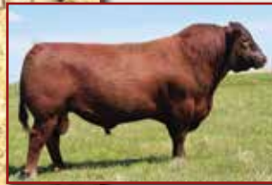
Sire: Barn Burner

Dam: RED NORTHLINE TRUEBLOOD 341T 1488364 RED C.D. FIREFLY TB 22'11 1603319 RED MEADOW CK FIRFLY 85N 1170969